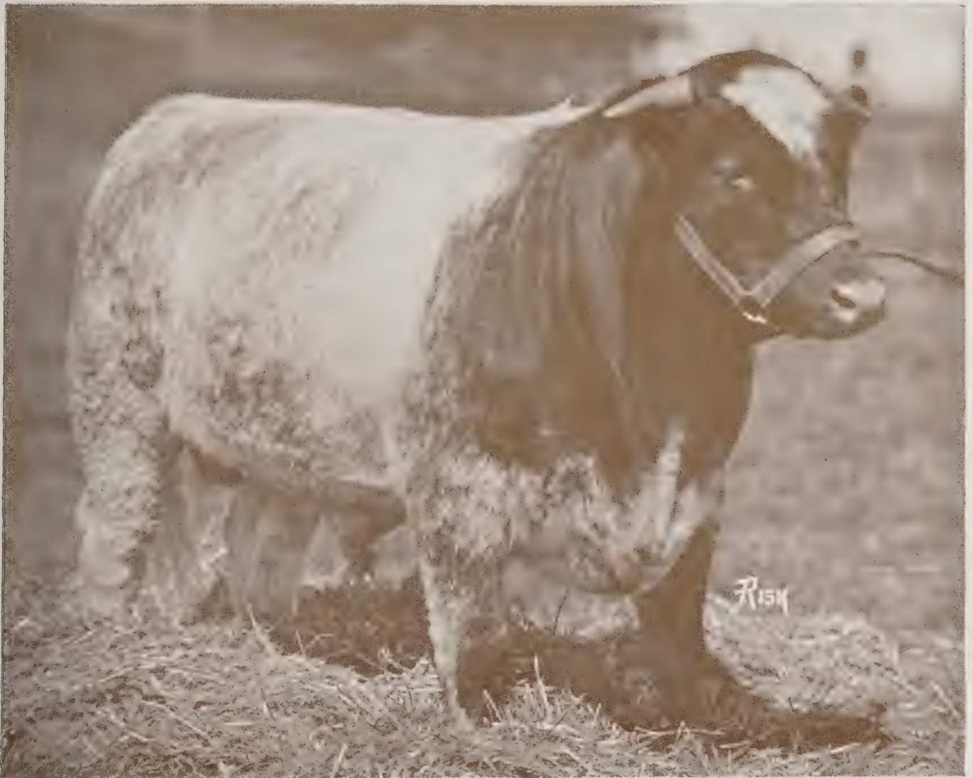
Superior Baron 816060, American Royal Prize Winner sired by the Futurity Grand Champion King Baron and out of the same Queen of Beauty cow that produced Supreme Magnet, the Junior Champion Bull of the 1922 Sni-A-Bar Show. Sire of Lots 9-11-12-13-16-20-36-43.